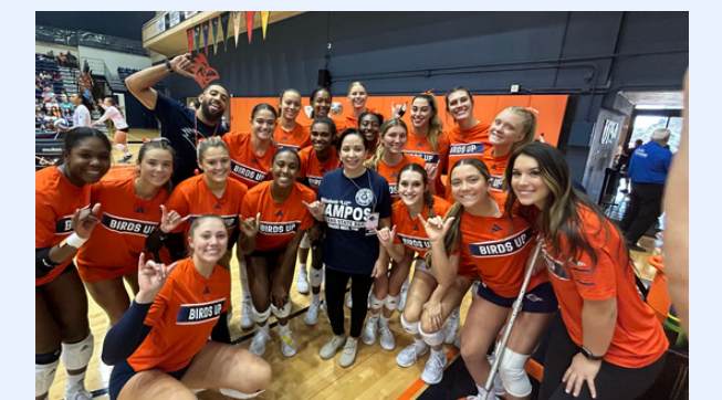
ST. JAMES THE APOSTLE