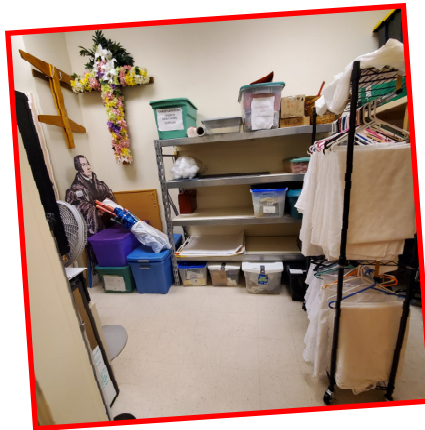
Storage Room 1

Thanks to Glen & Betty House for their diligent work in cleaning, and organizing Storage Room 1 and Electrical Room 2.