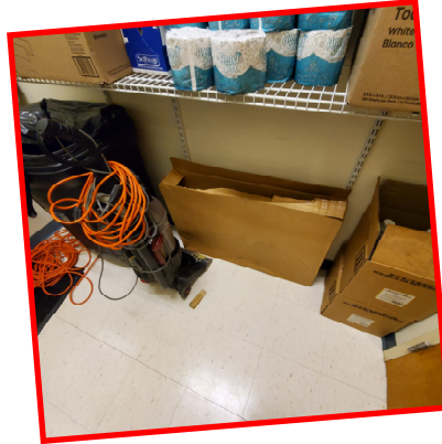
Electrical Room 1