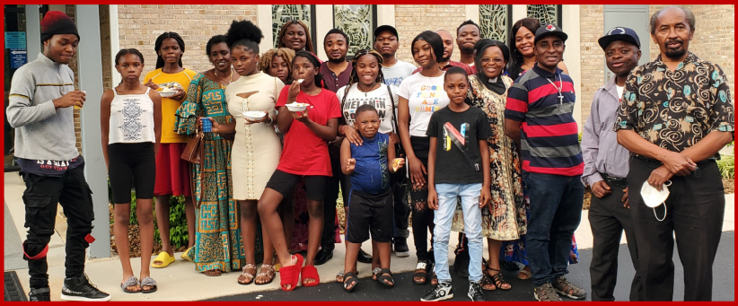
Kiswahili Lutheran Mission Church brings us youth, singing and a message. We sent them home with school supplies and a monetary gift