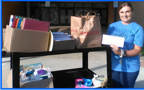
School Supplies for Martin Elementary