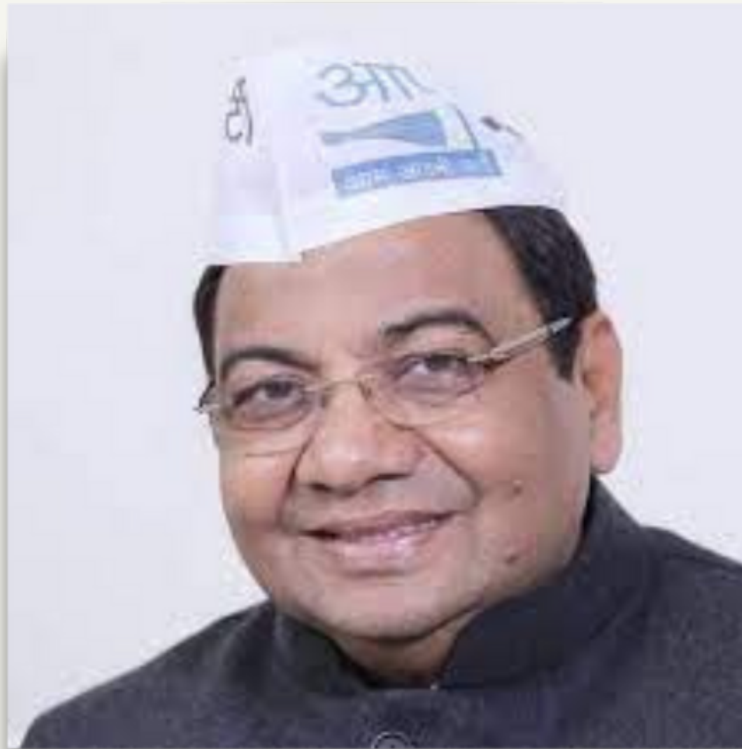
Dr. Sushil Gupta (Member of Parliament, : Rajya Sabha)