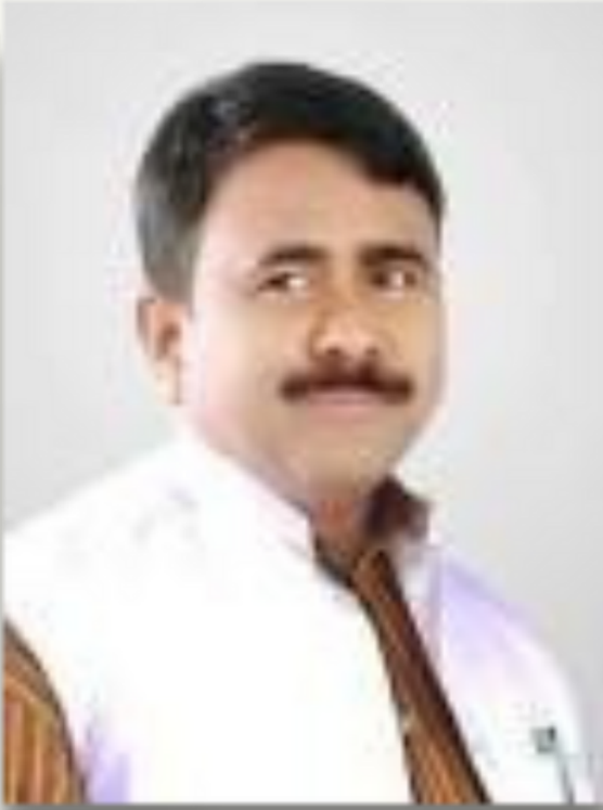
Mr. Abdul Khaleque (Member of Parliament, Barpeta, Assam: Lok Sabha)