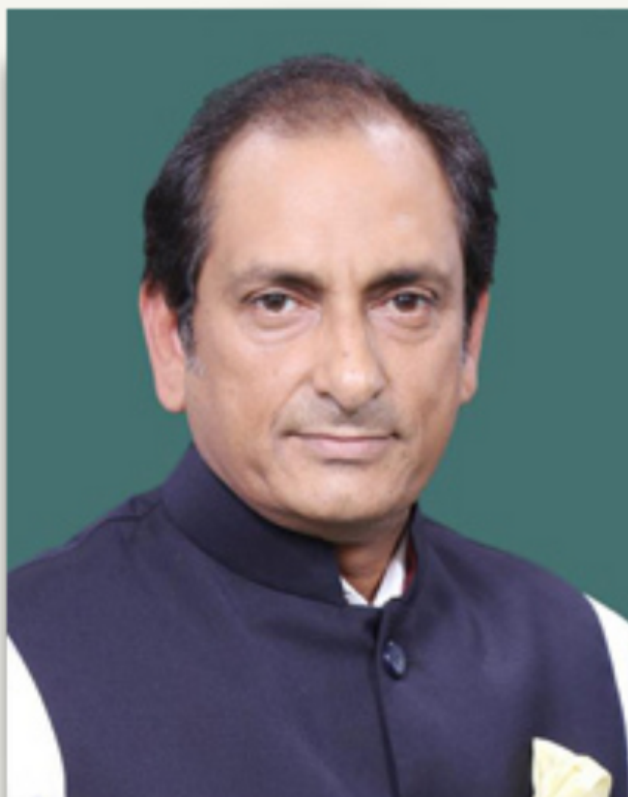
Mr. Choudhary Mehboob Ali Kaiser (Member of Parliament, Khagaria: Lok Sabha)