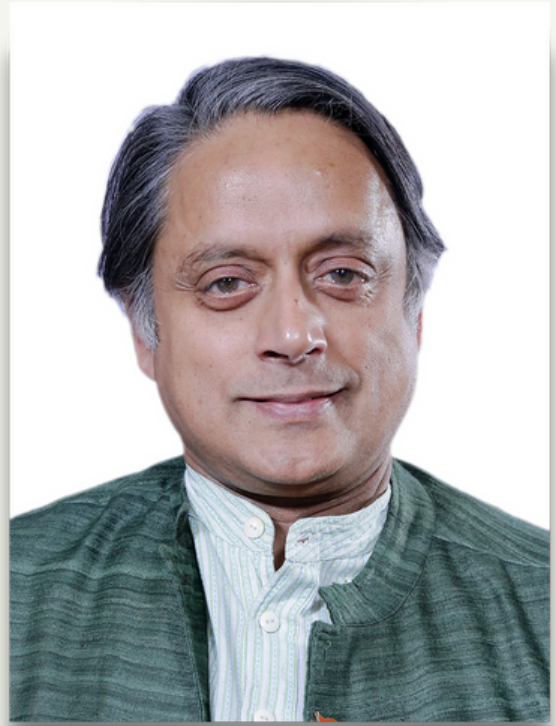
Dr. Shashi Tharoor (Member of Parliament, Thiruvananthapuram: Lok Sabha)