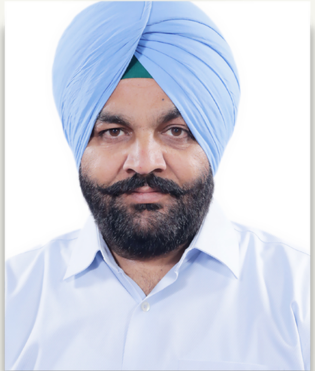
Mr. Gurjeet Singh Aujla (Member of Parliament, Amritsar: Lok Sabha)