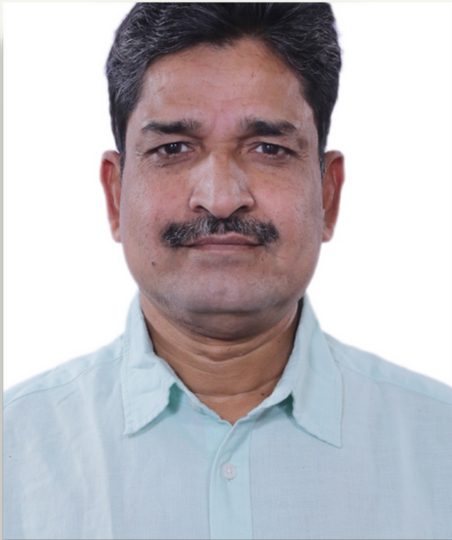
Dr. MD Jawed (Member of Parliament, Kishanganj: Lok Sabha)