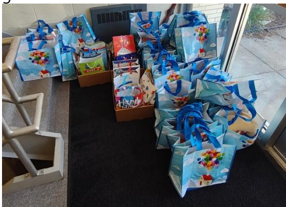
51 birthday bags headed to Community Care

Saturday, May 17 is our second annual "Junk in the Trunk" sponsored by CE with the support of the Outreach Committee. Please consider supporting this event by reserving a space or volunteering to help. More information is found in this newsletter. Proceeds will support the approximately six youth and three adults going to Lotts Creek in June.