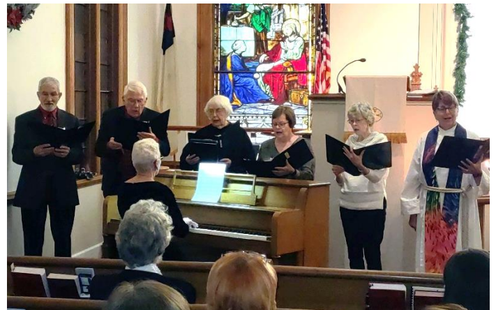
Christmas Eve 7 pm service