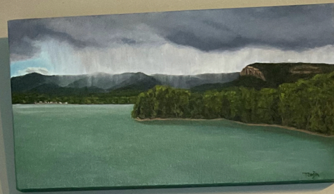
Tonja Smith Summer Showers in Linville Oil 8 x 16 $375

Original paintings, prints, books, and stickers