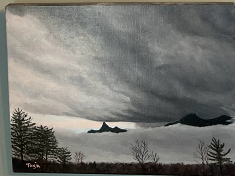
Tonja Smith Storm Oil 12 x 16 $250