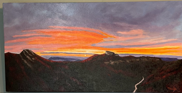
Tonja Smith Sunrise in the Gorge Oil 22 x 24 $500.00