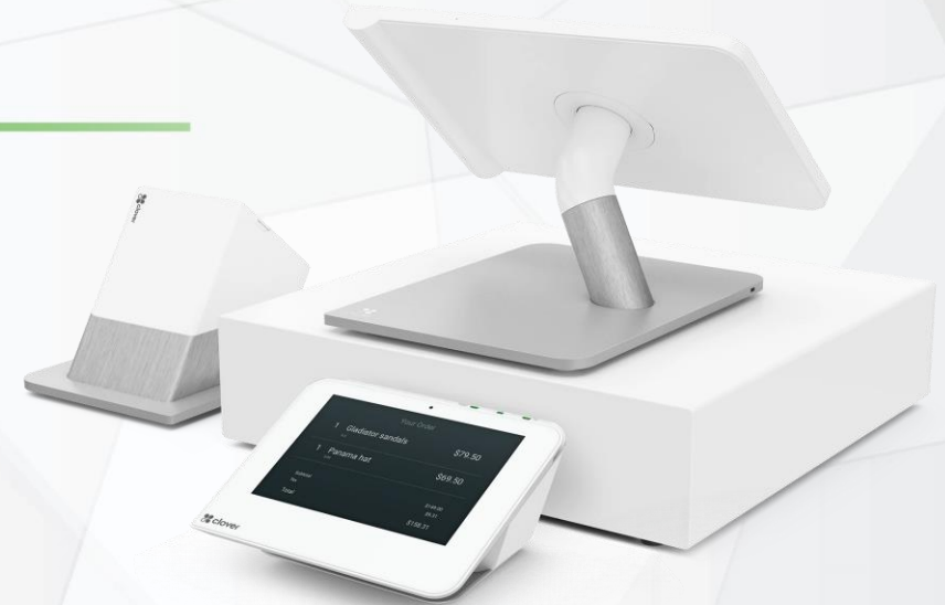
Clover Station Pro