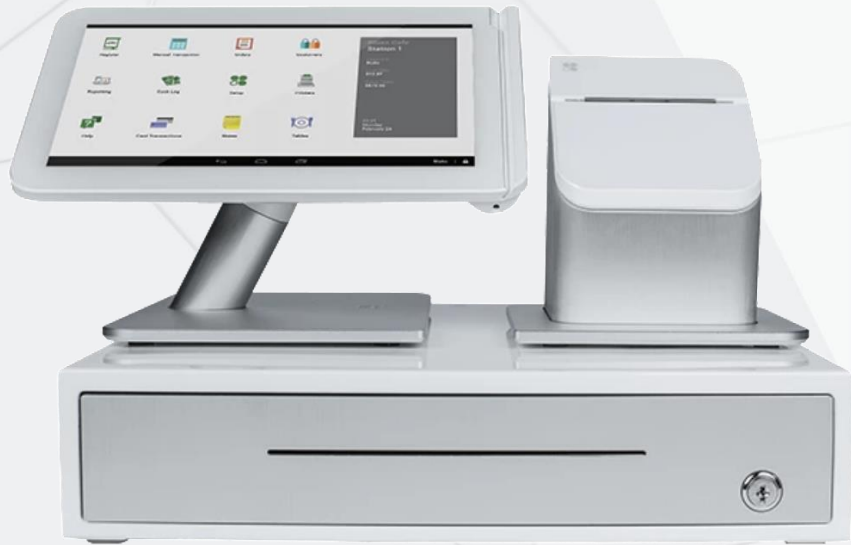
Clover Station 2018