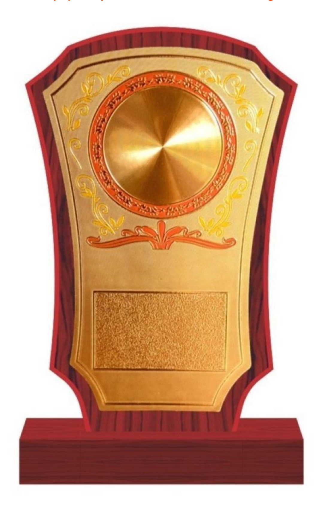
Trophy of Honour (Wooden, Golden Sticker) (For Indian students of P.G. Diploma, Advance & Professional Diploma only)