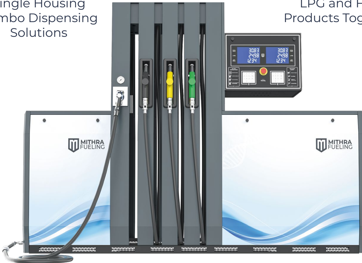
Inno 6000 H Combo Dispenser

Please contact us for detailed information about all our Combo Dispensers.