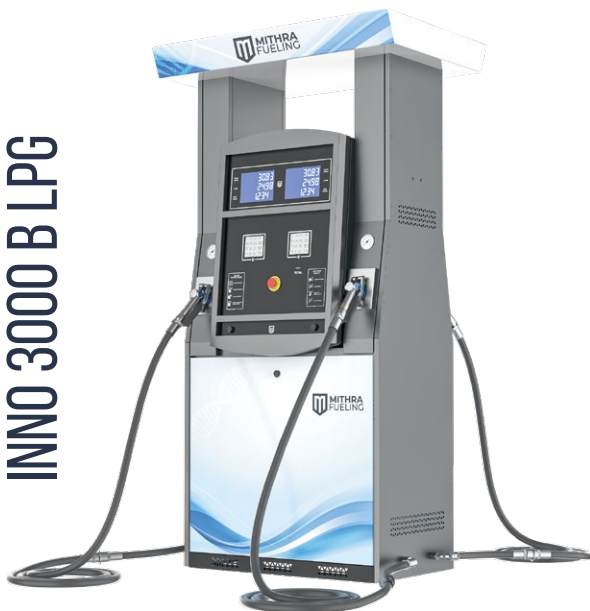
INNO 3000 B LPG