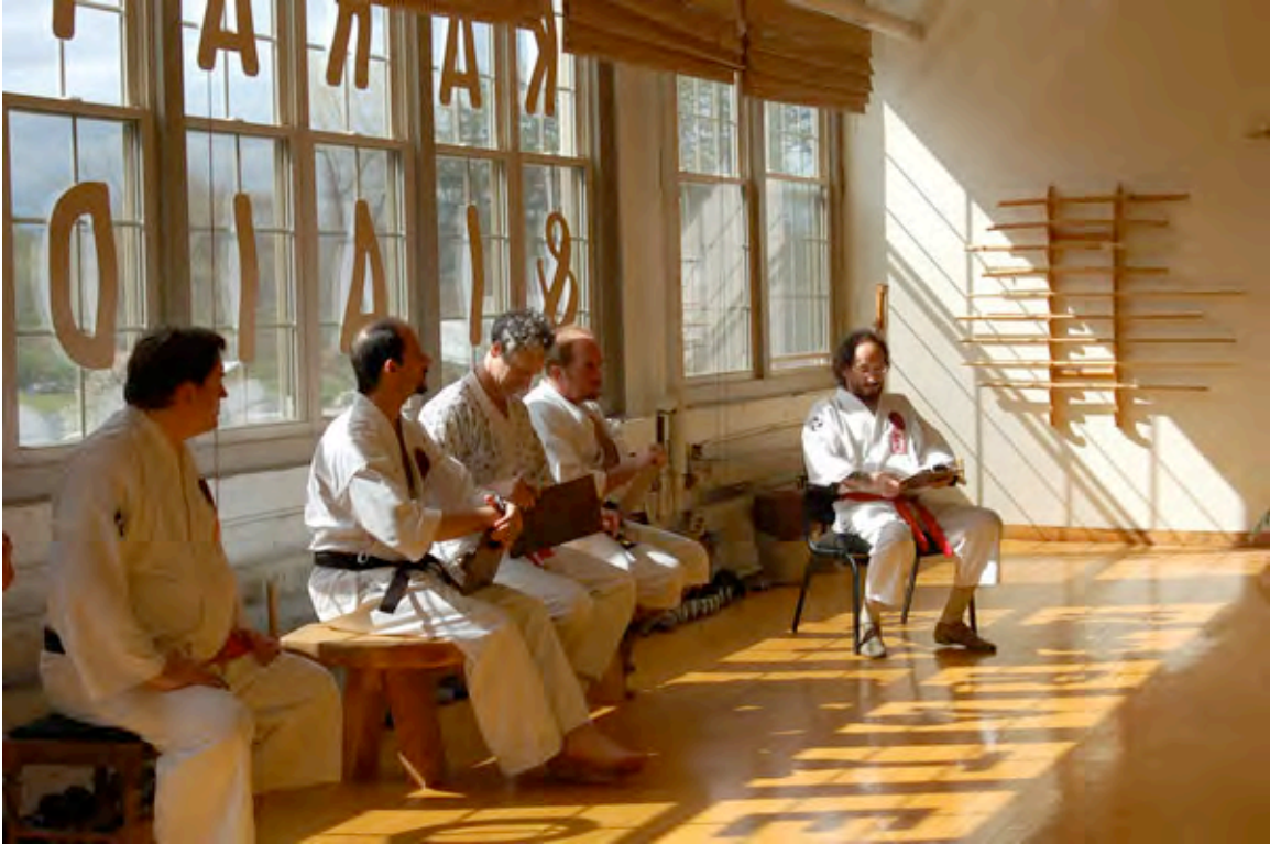
17 April 2010 at Northampton Ueshiro Pine Forest Karate Dojo