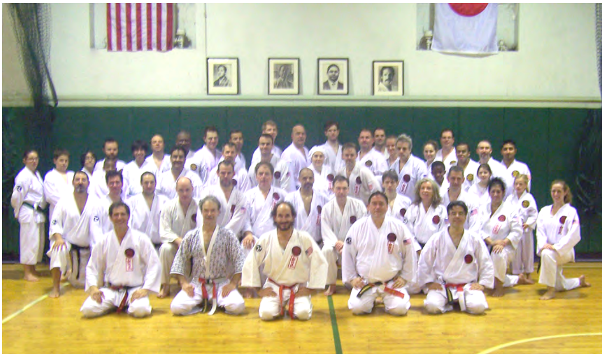
Hombu / Headquarters Dojo New York City 25th September 2010 48th Anniversary Celebration Workout and Training