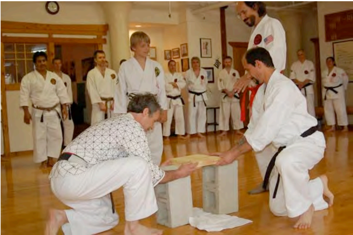
17 April 2010 at Northampton Ueshiro Pine Forest Karate Dojo

For more photos, see our Gallery at www.pineforestkarate.com