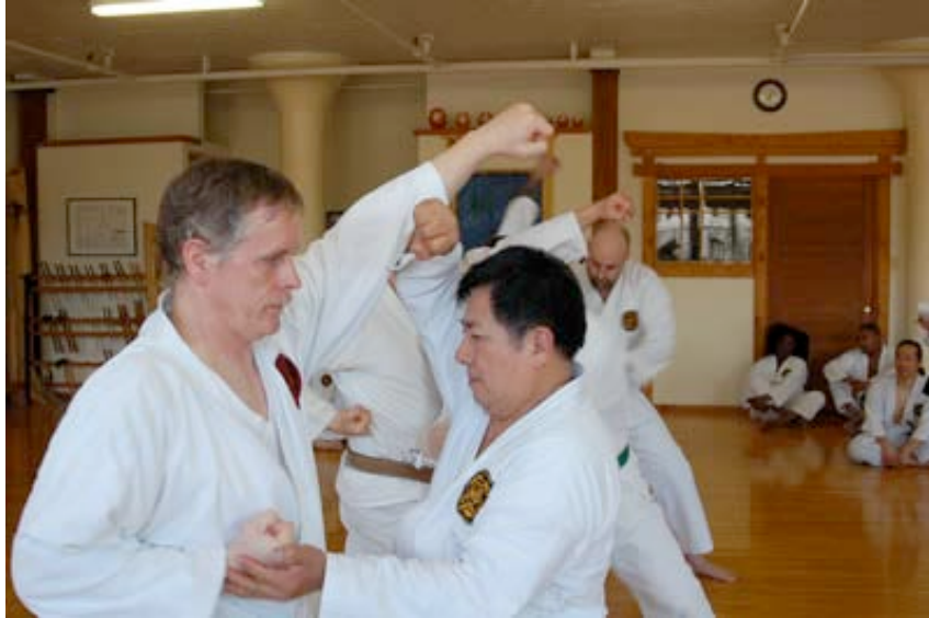
Rank Promotion 20 Feb 2010.