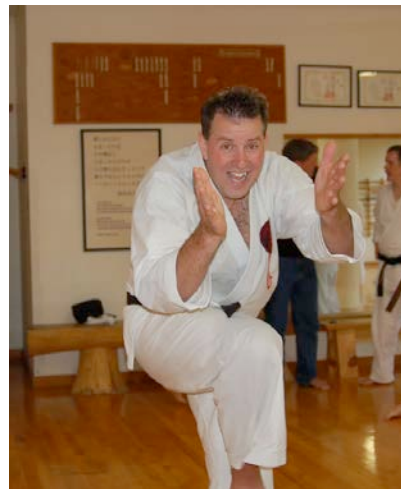
Reunion Anniversary Celebration.