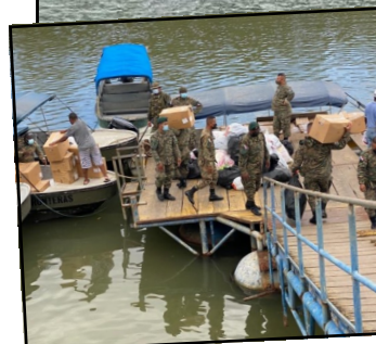
Police high speed boats delivered Christmas gifts and Panama Missions workers to remote river villages where children eagerly awaited their arrival.