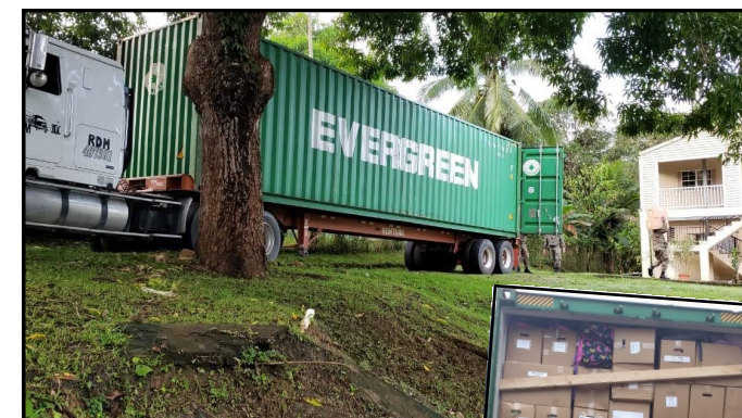
The shipping container loaded in Montgomery on Nov. 8 and unloaded at the Clinic of Hope in Sanson, Panama, on Dec. 12. Police and church members helped to unload, sort and organize the gifts.