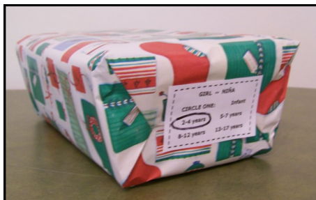
A well-wrapped gift.