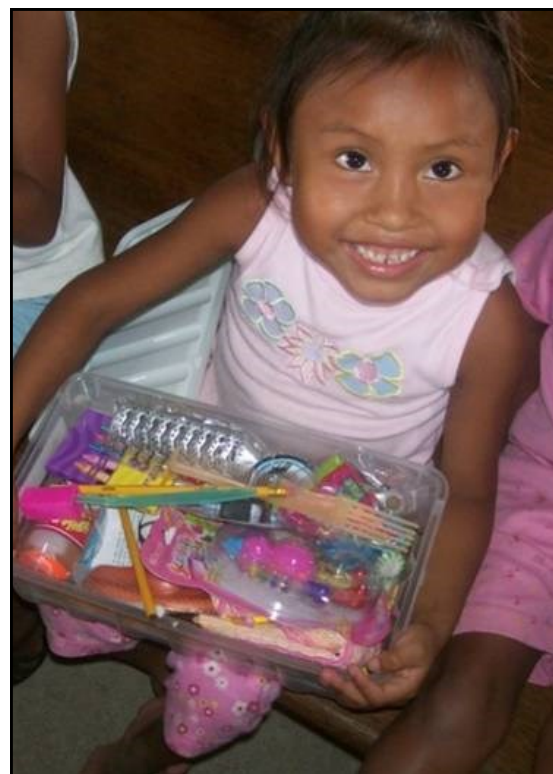
A happy child with a well-filled shoe box gift.

Please read this entire 2025 OCJ Guidebook for full details and updates.