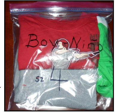
Zip bag labeled: Boy-Nino Sz. 4

1. Home sewn dresses for girls and shorts for boys. If you are sewing shorts, please provide a shirt to go with each one. Provide underwear if you can. Each dress or shorts/shirt should be in a zip lock bag with the size well marked on the outside of the bag.