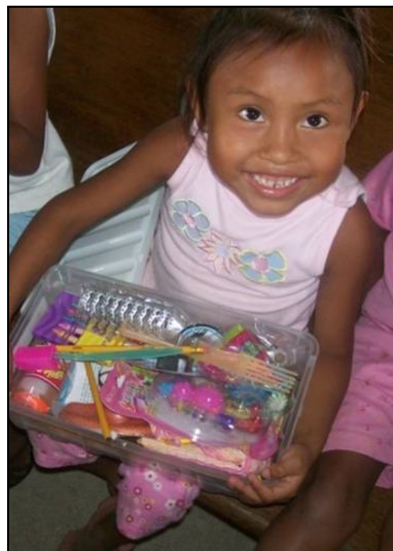
A happy child with a well-filled shoe box gift.

Please read this entire 2021 OCJ Guidebook for full details and updates.