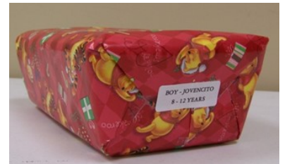
Example of a well wrapped gift.

7. Wrapping and Labeling Gifts. Each gift should be wrapped in Christmas paper. A label indicating the age/sex must be attached to one of the ends. A well-wrapped gift will hold up much better in shipping than one poorly wrapped.