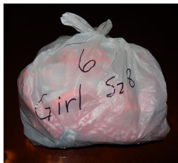
Use a separate bag for each different age/sex and indicate the number.

Sort everything by size/sex: 0-3 mo.; 3-6 mo.; 6-9 mo; 12 mo.; 18 & 24 mo. together; 2T; 3T; 4-5 together; 6; 7; 8; 10; 12.