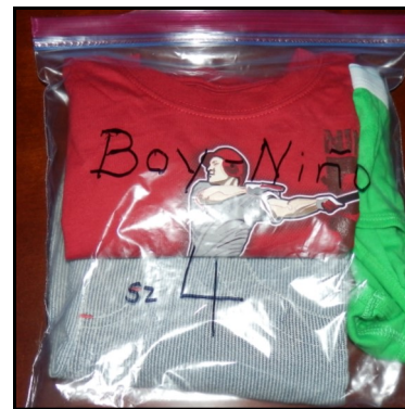
Zip bag labeled: Boy-Nino Sz. 4

Because of the large volume of new and used children's clothing we are receiving for Panama, we feel that new guidelines are necessary to enable us to efficiently deal with such a blessing for the children of Panama. Currently the volume of clothing - as wonderful as it is - requires more hours for sorting and packaging for shipment than our small volunteer crew in Montgomery can handle. WE NEED YOUR HELP!