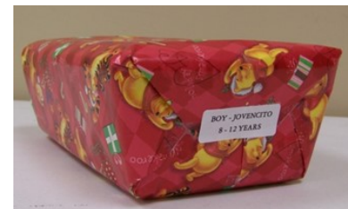
Example of a well wrapped gift.

6. Checking and Correcting Gifts. The most important task of the OCJ leaders is to check the gifts before they are wrapped and labeled. Sometimes folks get confused and mix items from different age groups and include items that are not appropriate for the age. Some gifts may be "skimpy" and need some help. Occasionally there are broken toys and items that are inappropriate or even dangerous. Some gifts are filled so full that you will need to "un-package" items or even remove a few so that the lid will close. You may need to secure some boxes with a rubber band before wrapping, but please don't use shipping tape as the children can't get it off.