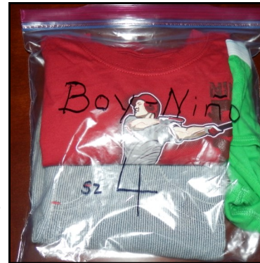
Zip bag labeled: Boy-Nino Sz. 4

Because of the large volume of new and used children's clothing we are receiving for Panama, we feel that new guidelines are necessary to enable us to efficiently deal with such a blessing for the children of Panama. Currently the volume of clothing - as wonderful as it is - requires more hours for sorting and packaging for shipment than our small volunteer crew in Montgomery can handle. WE NEED YOUR HELP!