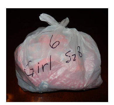
Use a separate bag for each different age/sex and indicate the number.

Sort everything by size/sex: 0-3 mo.; 3-6 mo.; 6-9 mo; 12 mo.; 18 & 24 mo. together; 2T; 3T; 4-5 together; 6; 7; 8; 10; 12.