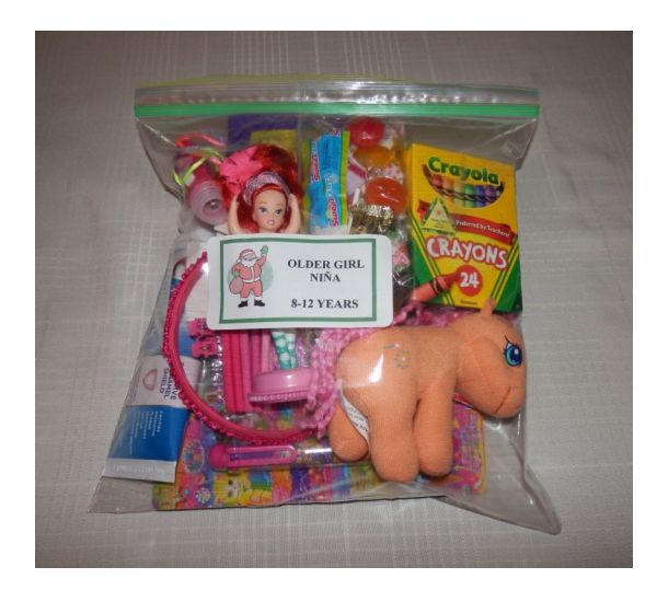
USE 1 GALLON ZIP LOCK BAGS DOUBLE ZIPPER TYPE IS BEST