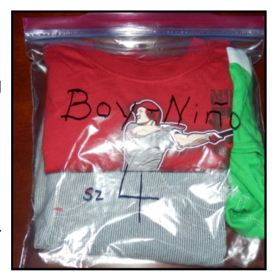
Zip bag labeled: Boy-Nino Sz. 4

1. Home sewn dresses for girls and shorts for boys. If you are sewing shorts, please provide a shirt to go with each one. Provide underwear if you can. Each dress or shorts/shirt should be in a zip lock bag with the size well marked on the outside of the bag.