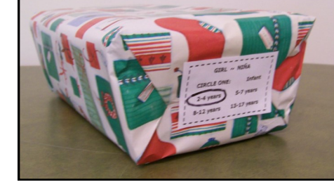
A well-wrapped gift.