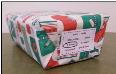
A well-wrapped gift.

2. POORLY WRAPPED GIFTS that don't make the trip very well.