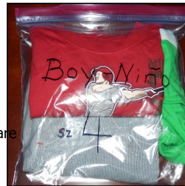
Zip bag labeled: Boy-Nino Sz. 4

Because of the large volume of new and used children's clothing we are receiving for Panama, we feel that new guidelines are necessary to enable us to efficiently deal with such a blessing for the children of Panama. Currently the volume of clothing - as wonderful as it is - requires more hours for sorting and packaging for shipment than our small volunteer crew in Montgomery can handle. WE NEED YOUR HELP!