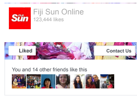
FIJISUN ONLINE @INSTAGRAM