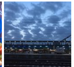
Early morning at the New Delhi train station 🚂👤👥 #learning #incredibleindia