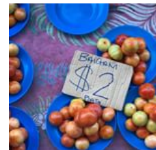
Saturday market shopping in the islands 🍌 #hakwa #onlyinsigatoka