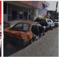
Old derelict vehicle abandoned on road side at Nukuwatu Street in Lami. #fijisun #roadside #wreckedcar