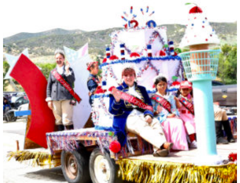
Lancaster Queens above & Chara Ranch below