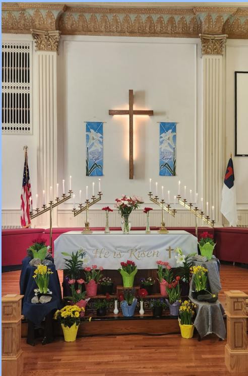
Easter Sunday at Green Street

Camp Mechuwana will be in full swing this summer. Camps fill up quickly so register early. There are scholarships available.. Send a copy of your camp registration page to the church office to be added to the scholarship list!