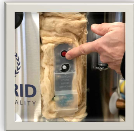
Fig. 2.2 Locate the reset button.