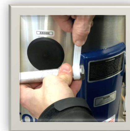
Image 1.3 Install new anode with PTEF tape or sealant.

Replacement anodes and other consumable parts can be purchased at www.torridmarine.com .