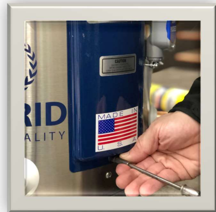
Fig. 2.1 Remove the electrical access panel door.

The thermostat on Torrid Marine Water Heaters features a safety high limit electrical cutoff switch. This switch is designed to prevent the Water Heater from overheating and causing the element to continue to operate beyond normal operating temperatures. If for any reason the internal water heats beyond 200° Fahrenheit, the high limit switch should activate and will need to be reset.