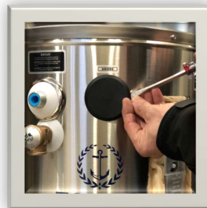
Image 1.1 Locate anode and remove plastic cover.

See www.torridmarine.com for additional helpful information in the FAQ section.