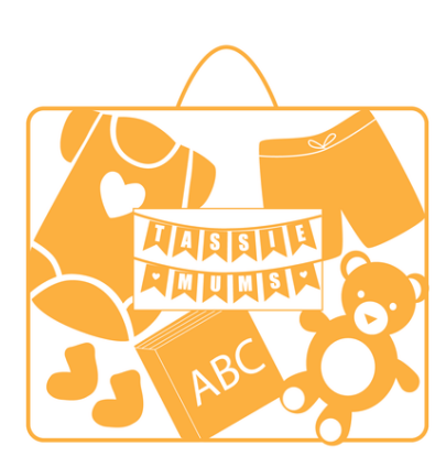
646 BUNDLES OF GOODS SUPPLIED