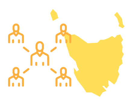
SUPPORTED 37 PROFESSIONAL ORGANISATIONS IN 17 COUNCIL AREAS.