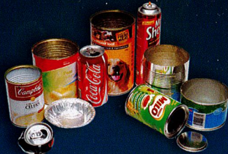
ALUMINUM & METAL CANS