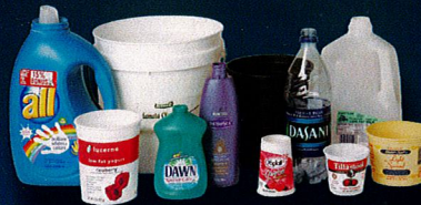
#1, #2 AND #5 PLASTIC FOOD AND BEVERAGE CONTAINERS (CAPS REMOVED)