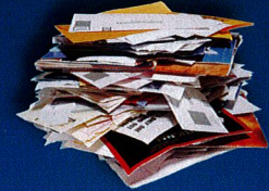
GREETING CARDS, REGULAR & JUNK MAIL