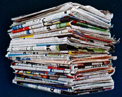
NEWSPAPERS, MAGAZINES, BROCHURES & INSERTS (NO PLASTIC BAGS, DO NOT TIE & BUNDLE)