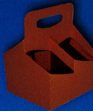
CARDBOARD BEVERAGE CARRIERS