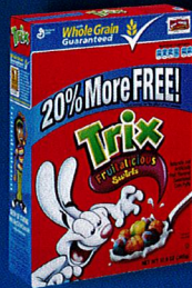
PAPERBOARD BOXES (CEREAL, PASTA & TISSUE)