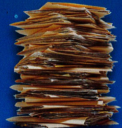
FILE FOLDERS, OFFICE PAPER