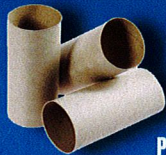
PAPER TOWEL ROLLS

NO NEED TO REMOVE: PAPERCLIPS, STAMPS, ADDRESS LABELS, METAL FASTENERS, CELLOPHANE ADDRESS WINDOWS, RUBBER BANDS, SPIRAL BINDINGS, PLASTIC TABS