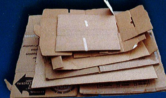
CORRUGATED CARDBOARD & PAPER BAGS FLATTENED (NO LARGER THAN 3 X 3)