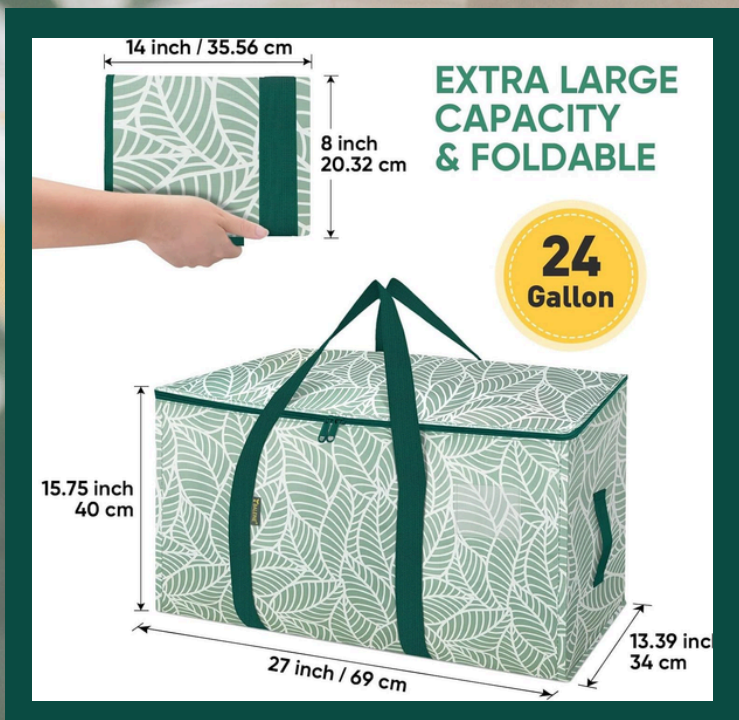
#1 - MOVING BAGS