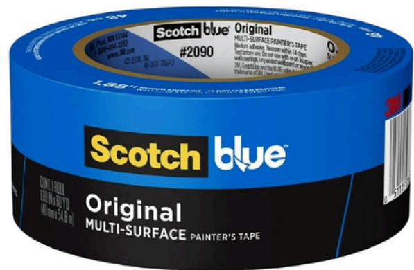
#8 - BLUE PAINTER'S TAPE

THESE ITEMS ARE GOING TO HELP YOU WRAP DRAWERS AND BINS/BASKETS THAT YOU CAN PRE-PACK TO KEEP ALL THE ITEMS CONTAINED WITHIN; HELP YOU INSTALL BED RISERS; CLEAN WALL AREAS FOR CONTACT WITH ADHESIVES LIKE COMMAND STRIPES; AND TAPE FOR THE WALLS IF ITEMS ARE NOT STICKING EVEN ONCE CLEAN.