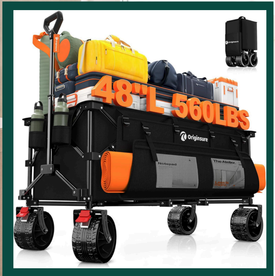
#2 - WAGON