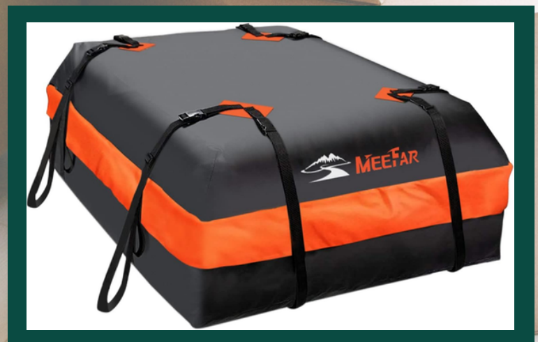
#5 - CAR ROOF STORAGE

THERE ARE A COUPLE KEY "MUST HAVES" YOU ARE GOING TO NEED, AND A FEW "NICE TO HAVES" FOR MOVE IN/OUT OF DORM LIFE THAT WILL MAKE IT A BIT EASIER!