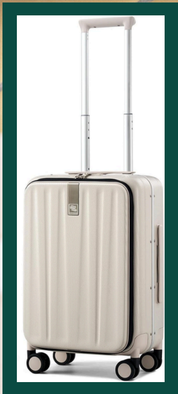
#4 - CARRY ON LUGGAGE