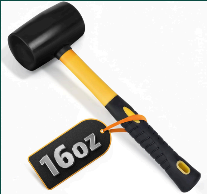
#6 - MALLET