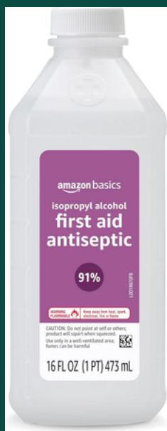
#7 - RUBBING ALCHOL