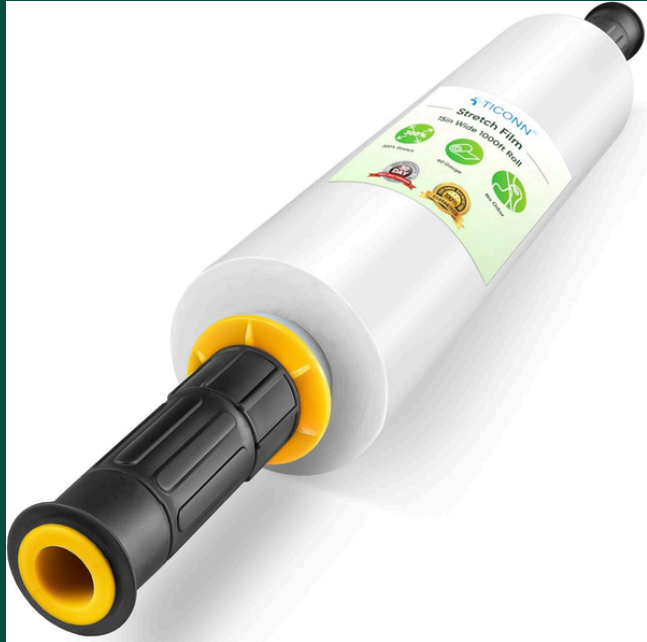
#5 - PLASTIC WRAP