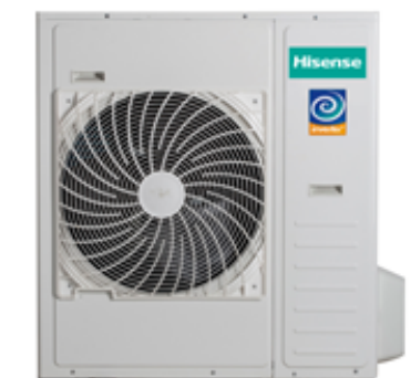
Connect up to 4 Indoor Units