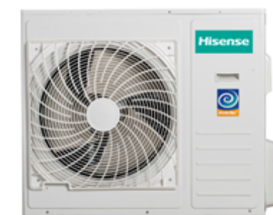
Connect up to 3 Indoor Units