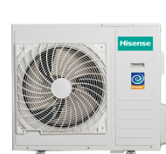
Connect up to 2 Indoor Units