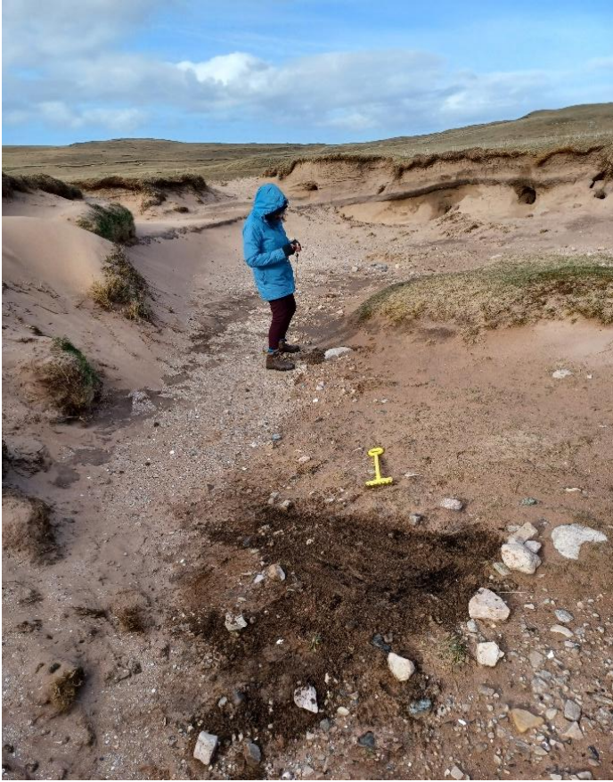
Figure 3. Charcoal-contaminated soil on location.