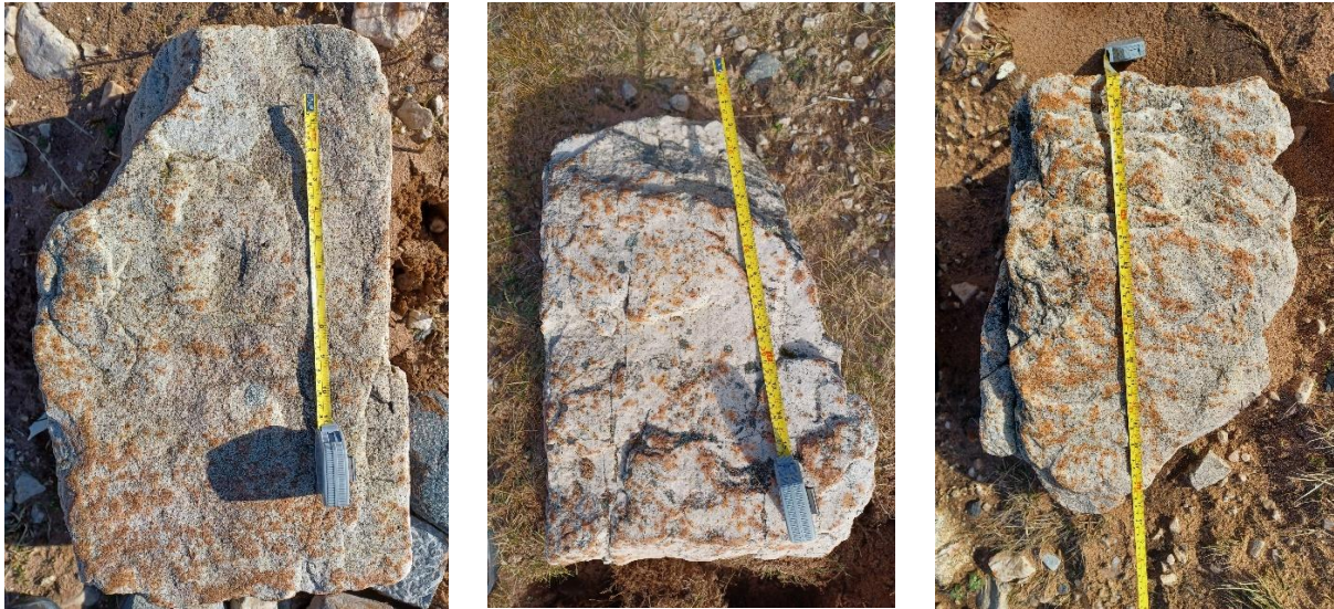
Figure 4. Quartzite anvil stones on the Loch Borrallie Headland.

The size of the anvils is in the order of 55 X 35 X 30 cm, with some corners broken off, probably because of prolonged use. The surface shows clear iron oxide staining of the working face which varies in smoothness due to impact pitting. There is significant iron splatter (solidified iron oxide droplets) adhering to the quartzite surface as small, dark, sub-spherical to flattened droplets. The Iron oxide particles have penetrated the grain boundaries of the quartzite surface, producing a reddish-brown to orange-brown discolouration.