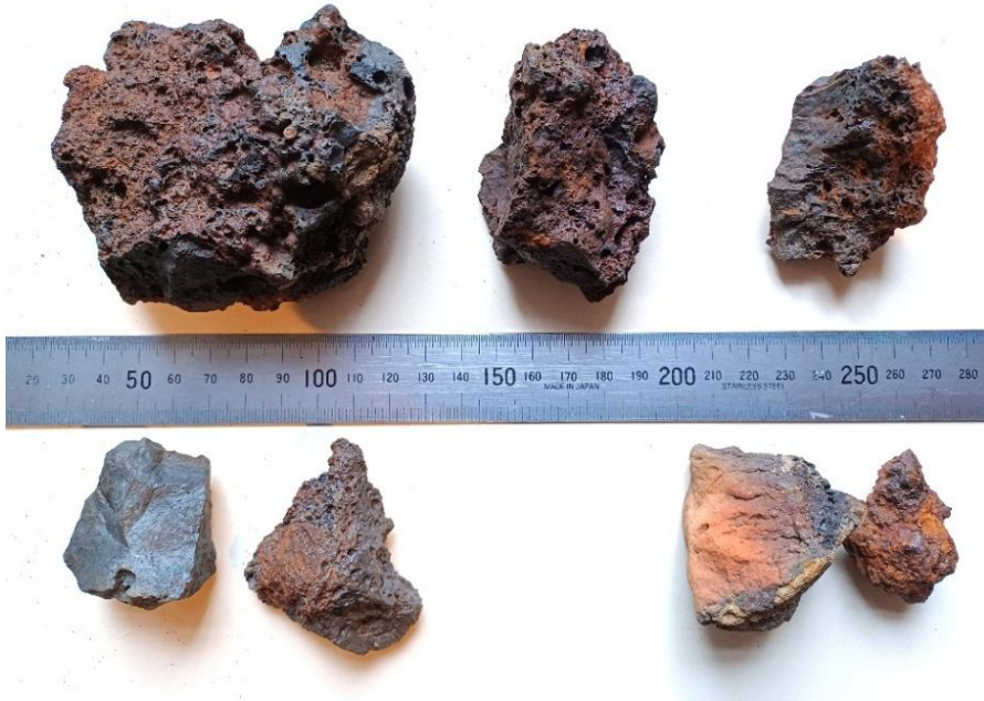
Figure 6. Representative iron-slag samples. Bloomer fragments (2) bottom right.

All the different types of slag are found in the research area and we sampled 2,5 kg of slag on site (Figure 6). The samples vary from being compact, homogenous, and dense with very low porosity (tap slag), to highly heterogenous, porous samples with charcoal impressions (bottom slag). We also sampled hammer-scales (Figure 7) and some bloomer fragments (Figure 6), all consistent with a metalworking smithy.