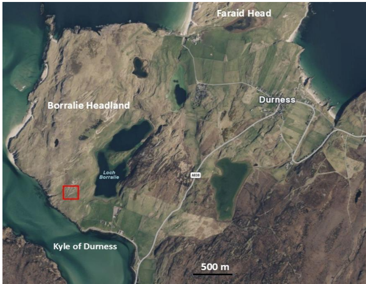
Figure 1. Location of anvil site east of the Kyle of Durness (red square).

The calcareous and freely draining nature of the local soils has produced a green and fertile pocket of the land, which includes the survey area. It is characterised by sandy grassland, eroded by the wind in places, forming blow-throughs, exposing sandy faces where the thin turf has been scoured off (Figure 2). In some places the soil has been eroded down to the dolomitic limestone bedrock.