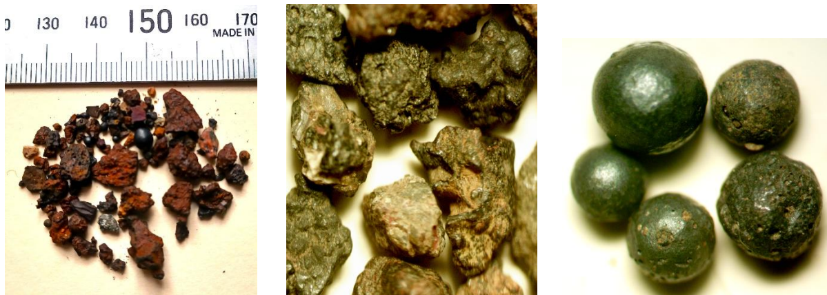
Figure 7. Hammer-scales, flaky (middle, 5 mm across) and spherical (right, 5 mm across).

All the different types of slag are found in the research area and we sampled 2,5 kg of slag on site (Figure 6). The samples vary from being compact, homogenous, and dense with very low porosity (tap slag), to highly heterogenous, porous samples with charcoal impressions (bottom slag). We also sampled hammer-scales (Figure 7) and some bloomer fragments (Figure 6), all consistent with a metalworking smithy.