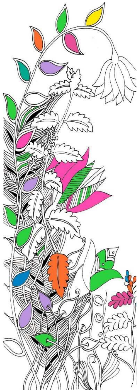
Graphic from United Methodist Women Program Book 2017-2018