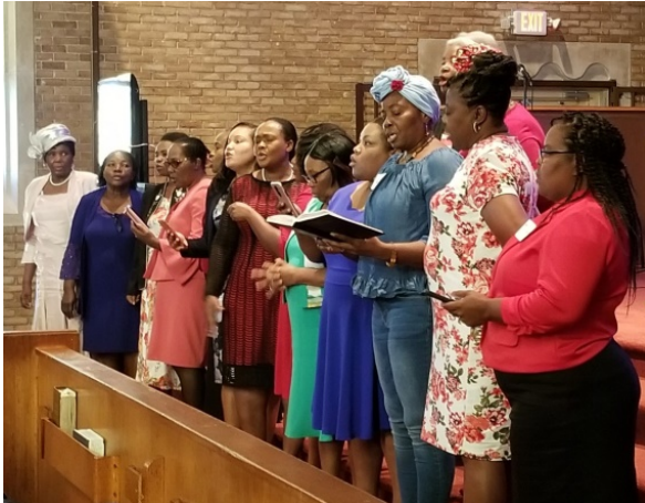
Our SE District Haitian Choir is comprised of members from Bethesda, Grace, and Hallandale churches.

On Saturday, December 14, we celebrated our beloved community at Grace Haitian United Methodist Mission in Miami where we enjoyed the many talents—singing, dancing, skits—as well as the culinary tastes, fellowship and fun from the diverse cultures represented by South East District United Methodist Women.