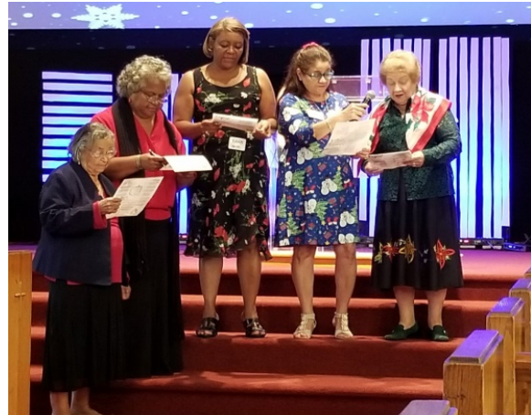
Our SE District Hispanic Choir has members from Kendall, Miami Lakes and Iglesia Cristiana Juan Wesley units.