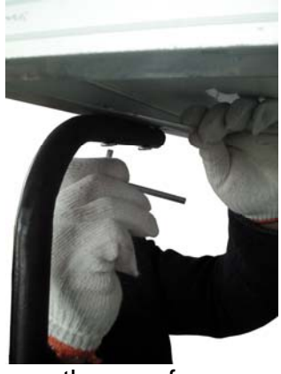
the front frame

9. Fix the solar panel onto the front frames and rear frames.