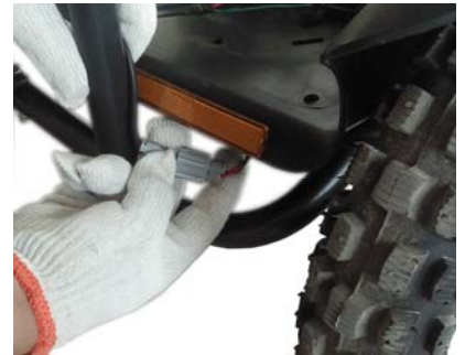
the lower rear frame