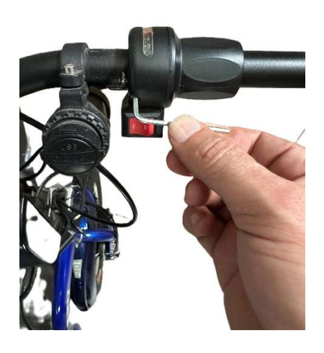
Loosen set screw and slide throttle off (you may need to loosen headlight to get off bar)