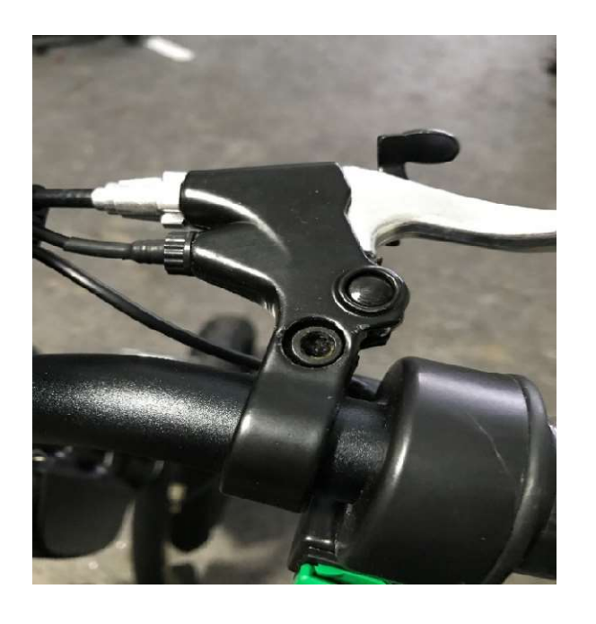
Mounting mirror to brake lever