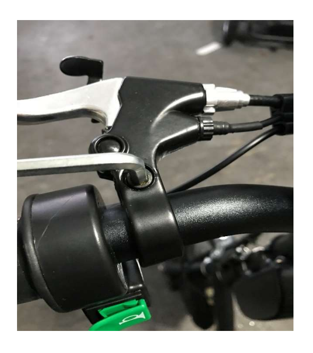
Remove allen bolt with allen Wrench.