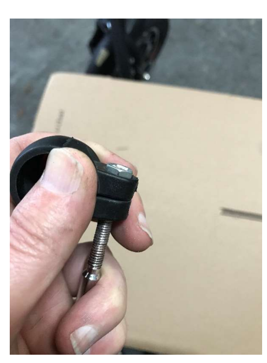
Install nut in rt. Side clamp