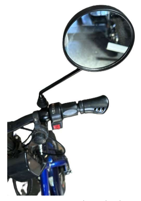
Mirror mounted with throttle and end grip reinstalled. (Be sure end grip does not physically touch throttle as this could cause throttle to get stuck)