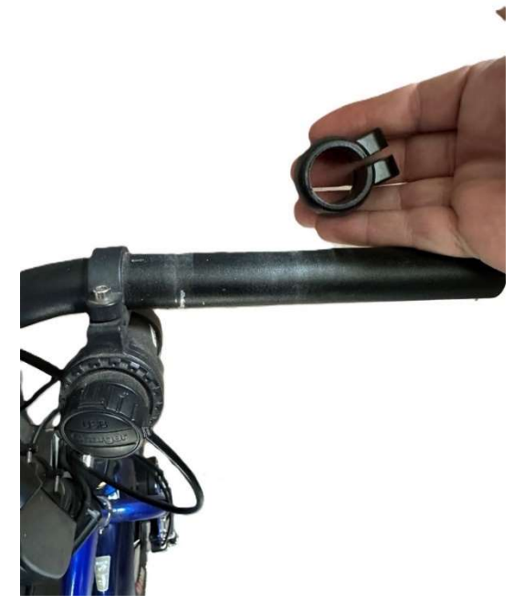
Right side mirror clamp