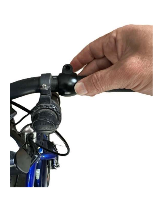
Slide clamp threaded side down