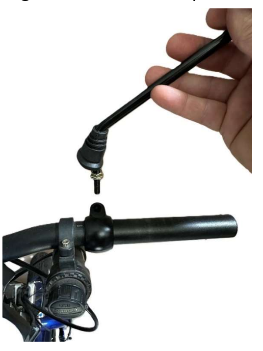
Insert mirror and screw into threaded side of clamp.