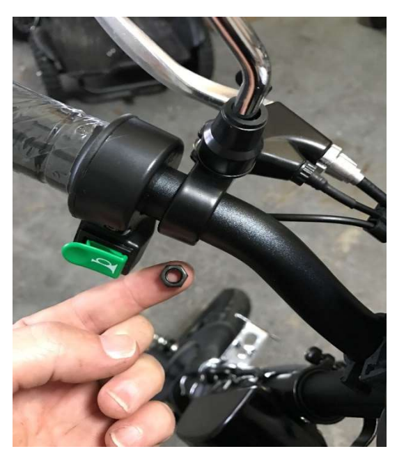
Tighten mirror from the bottom of