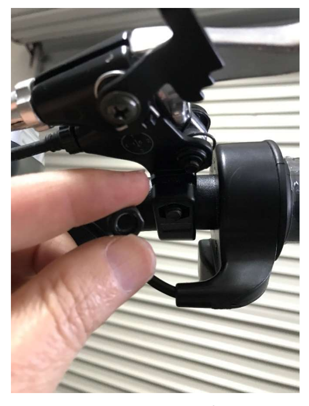
Retain nut under lever for later