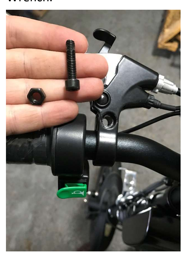
Allen bolt and nut removed