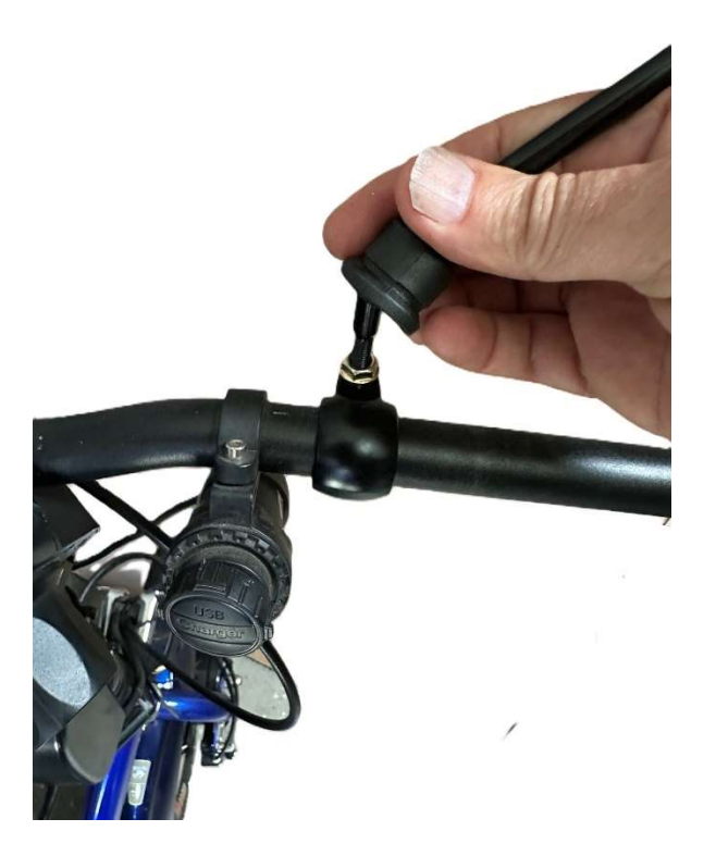
Tighten nut & slide cover over.