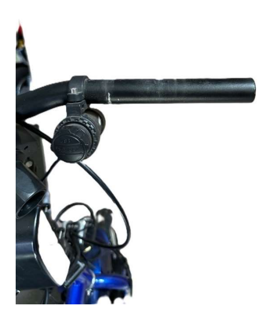
Throttle and end grip removed