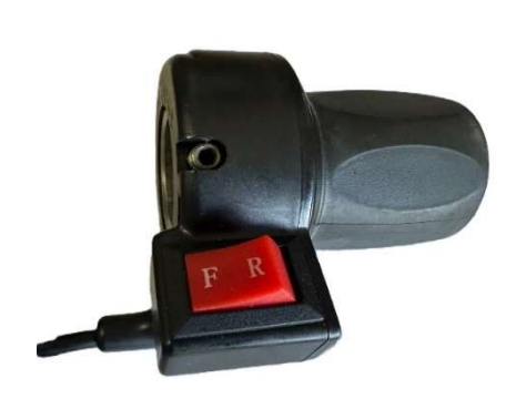
Locate the set screw on throttle