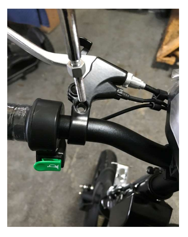
insert mirror into brake lever.