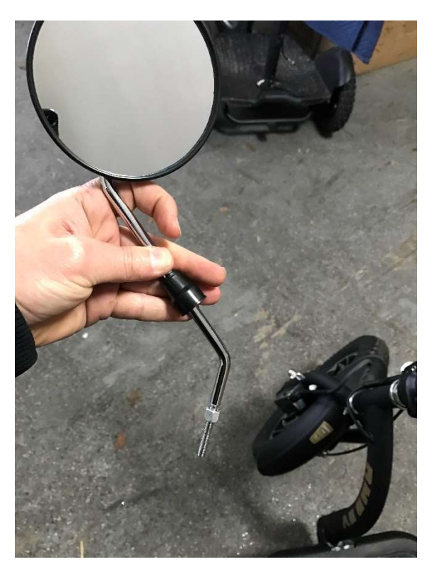
With dust cap and nut above