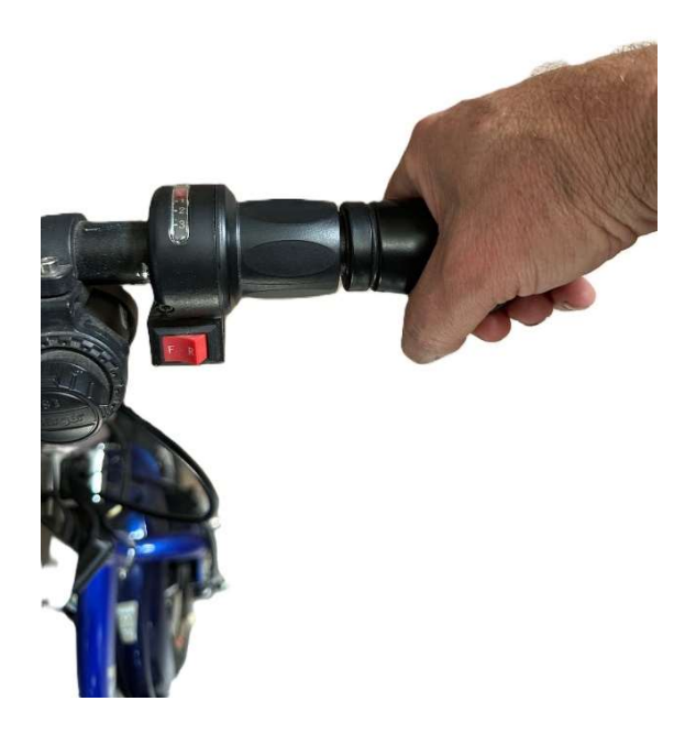
Twist the end grip while pulling