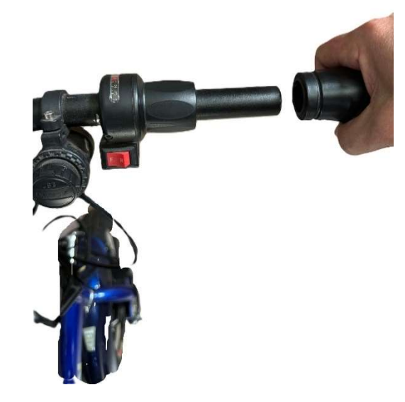
End grip removed