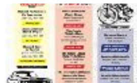
WHAT TO EXPECT IN 2025