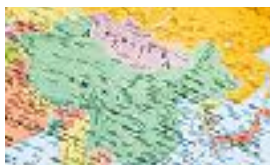
THE YEAR IN REVIEW

The Gazette of the Waterlooville motorcycle club