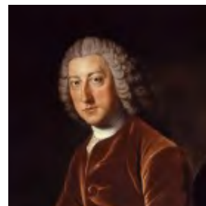
Portrait of William Pitt, by William Hoare, ca. 1754. North Carolina Museum of Art.