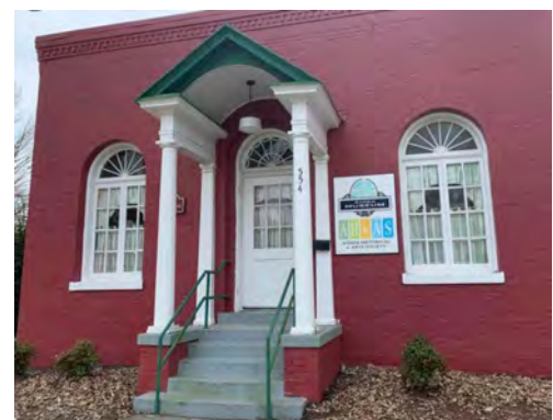
Top: The Ayden Community Bldg., 548 Second St.