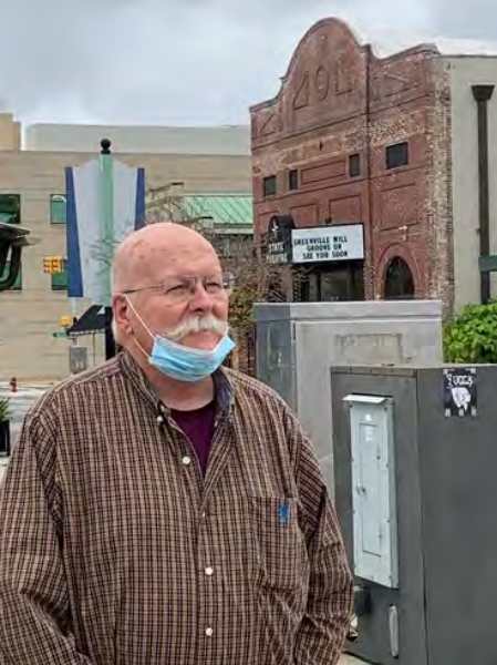
Celebrating Farmville's 150th Year

Farmville History: On its Sesquicentennial November 2021 (See our website for updates)