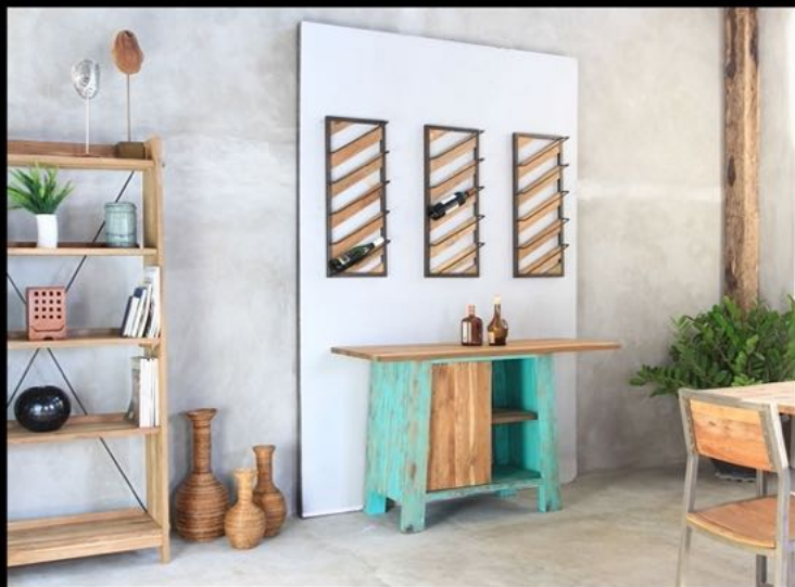
FIJI - bottle rack recycled wood and metal frame