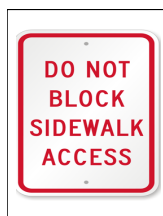
Remember people with walkers, wheelchairs or a

wheels on the swale or park a car horizontally at the end of the drive to avoid blocking the sidewalk. Obtain permission from your neighbor to park in front of their home on their swale.