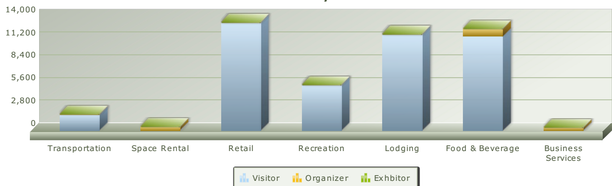
Sales By Sector

* indicates that the calculator's model defaults were used