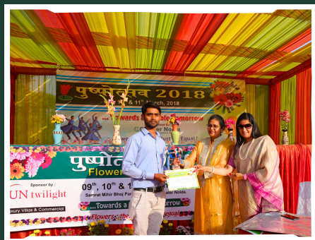
First Price & Award Flower Show Noida