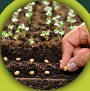
Seeds And Seedings