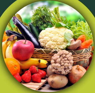
Organic Vegetables And Fruits