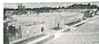
Pittsville Career and Technical Education Center

Career and technical education (CTE) is an educational approach to teaching technical skills that lead to careers for middle, high, and post secondary students. Compared to vocational education which is only taught in post secondary scenarios and is very specific to one career track, CTE can be broad in range from medical, business, sales, finance, IT, STEM, manufacturing, logistics, computer-based mathematics, political science, government, law, agriculture, construction, trades, craftsman, cosmetology, culinary, creative arts, music, to audiovisual technology. [1] The Federal Government of the United States has invested $1.462 billion in 2023 [2] and States have invested billions [3] to renovate classrooms, spaces, and build dedicated buildings for the equipment, supplies, tools, software, and hardware to accommodate CTE. [4][5]