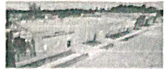
Pittsville Career and Technical Education Center

Career and technical education (CTE) is an educational approach to teaching technical skills that lead to careers for middle, high, and post secondary students. Compared to vocational education which is only taught in post secondary scenarios and is very specific to one career track, CTE can be broad in range from medical, business, sales, finance, IT, STEM, manufacturing, logistics, computer-based mathematics, political science, government, law, agriculture, construction, trades, craftsman, cosmetology, culinary, creative arts, music, to audiovisual technology. [1] The Federal Government of the United States has invested $1.462 billion in 2023 [2] and States have invested billions [3] to renovate classrooms, spaces, and build dedicated buildings for the equipment, supplies, tools, software, and hardware to accommodate CTE. [4][5]