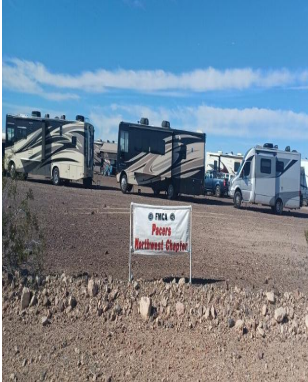
Pacers circle the wagons