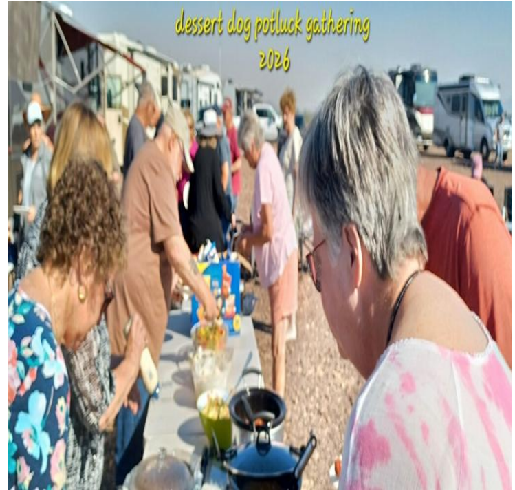
No one goes home hungry!

After desert dogs, one needs to let the feast settle; so some take naps, and some swap stories.