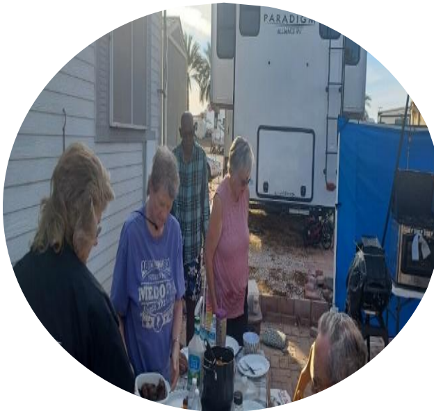
Food is an essential part of "Camping.

After desert dogs, one needs to let the feast settle; so some take naps, and some swap stories.