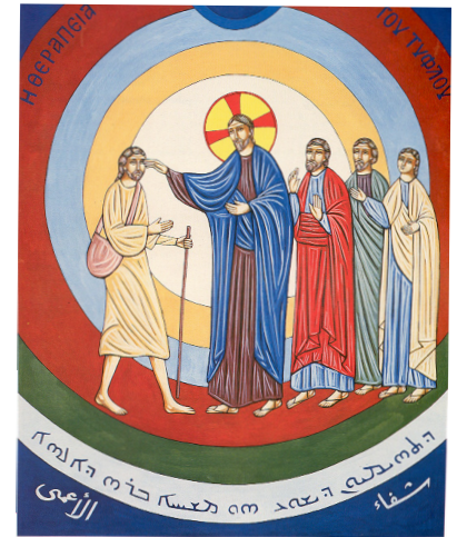
THE HEALING OF THE BLIND MAN The Maronite Icons: Modern Sacred Art. Dar Sader Publishers: Beirut 1999.

They came to Jericho. And as he was leaving Jericho with his disciples and a sizable crowd, Bartimaeus, a blind man, the son of Timaeus, sat by the roadside begging. On hearing that it was Jesus of Nazareth, he began to cry out and say, "Jesus, son of David, have pity on me." And many rebuked him, telling him to be silent. But he kept calling out all the more, "Son of David, have pity on me." Jesus stopped and said, "Call him." So they called the blind man, saying to him, "Take courage; get up, he is calling you." He threw aside his cloak, sprang up, and came to Jesus. Jesus said to him in reply, "What do you want me to do for you?" The blind man replied to him, "Master, I want to see." Jesus told him, "Go your way; your faith has saved you." Immediately he received his sight and followed him on the way. This is the Truth. Peace be with you.