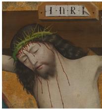
The Liesborn Altarpiece: Head of Christ Crucified. c 1480s. London: The National Gallery