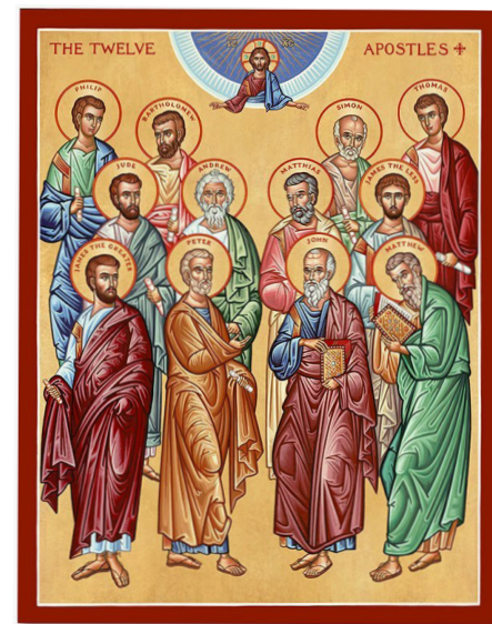
ICON OF THE TWELVE APOSTLES.

Then he summoned his twelve disciples and gave them authority over unclean spirits to drive them out and to cure every disease and every illness. The names of the twelve apostles are these: first, Simon called Peter, and his brother Andrew; James, the son of Zebedee, and his brother John; Philip and Bartholomew, Thomas and Matthew the tax collector; James, the son of Alphaeus, and Thaddeus; Simon the Cananean, and Judas Iscariot who betrayed him. Jesus sent out these twelve after instructing them thus, "Do not go into pagan territory or enter a Samaritan town. Go rather to the lost sheep of the house of Israel. As you go, make this proclamation: 'The kingdom of heaven is at hand.' This is the truth. Peace be with you.