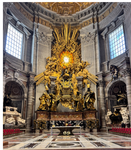
The Chair of St. Peter in St. Peter's Basilica.

Description of the Chair of St. Peter by Pope Benedict XVI during his General Audience, Feb. 22, 2006.