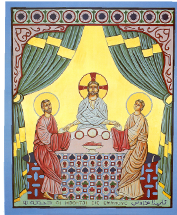
DISCIPLES OF EMMAUS The Maronite Icons: Modern Sacred Art. Dar Sader Publishers: Beirut 1999.

spoke! Was it not necessary that the Messiah should suffer these things and enter into his glory?" Then beginning with Moses and all the prophets, he interpreted to them what referred to him in all the scriptures. As they approached the village to which they were going, he gave the impression that he was going on farther. But they urged him, "Stay with us, for it is nearly evening and the day is almost over." So he went in to stay with them. And it happened that, while he was with them at table, he took bread, said the blessing, broke it, and gave it to them. With that their eyes were opened and they recognized him, but he vanished from their sight. Then they said to each other, "Were not our hearts burning (within us) while he spoke to us on the way and opened the scriptures to us?" So they set out at once and returned to Jerusalem where they found gathered together the eleven and those with them who were saying, "The Lord has truly been raised and has appeared to Simon!" Then the two recounted what had taken place on the way and how he was made known to them in the breaking of the bread. This is the Truth. Peace be with you.