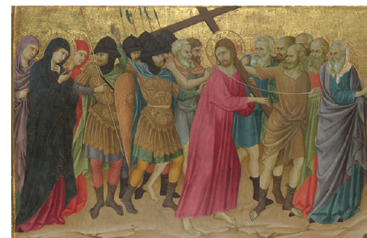
THE WAY TO CALVARY. Ugolino di Nerio c.1325-8. London, The National Gallery.

STATIONS OF THE CROSS every Friday during Lent 5 p.m. at St. Agnes Chapel