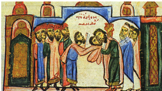
Anonymous, 13th Century. The surrender of the Holy Mandylion bearing the face of Christ, by the inhabitants of Edessa to the Byzantines in 944. Chronography of John Skylitzes, cod. Vitr. 26-2, folio 131a, Madrid National Library.