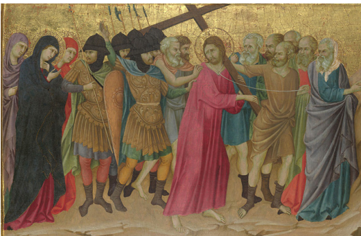
THE WAY TO CALVARY. Ugolino di Nerio c.1325-8. London, The National Gallery.

5:00 p.m every Friday during Lent at St. Agnes Chapel