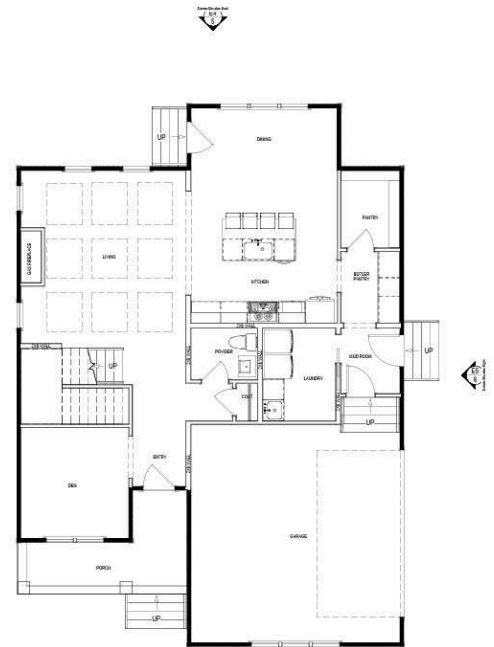
The "Brook" House Plan