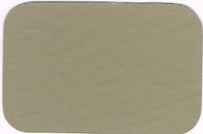
Light Oak GI-43 2#