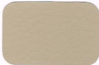
Aztec Gold G-29 1-1/2#