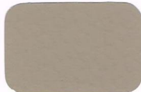
Buckskin Brown A-24 1-1/2#