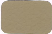
Ginger GI-43 4#