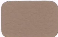
Cinnabar AR-60 2#