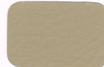
UCR Tan U-27 2#