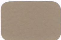
Adobe A-24 2-1/2#