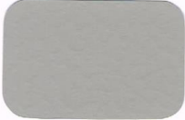
Graystone C-63 1/4#