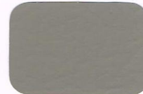
Canyon Brown Y-57 2-1/2#