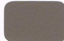
Cal-Tan C-63 3#