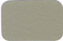
Vintage Gold I-88 2#