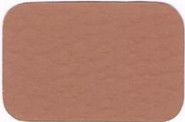
Brick Red R-82 2#